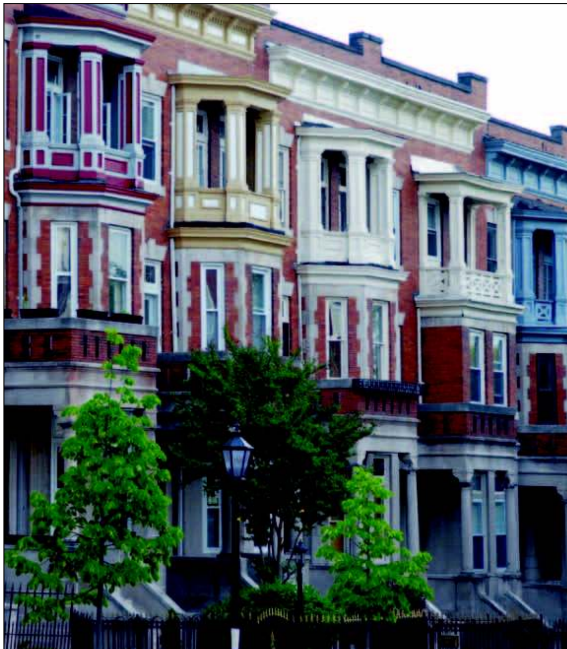
Unique multilevel balconies are just a few of the features you will find in many of the Reservoir Hill homes.

From hallmark projects like the Community Garden on Lennox Street and the rose garden on Eutaw Place to ongoing projects like planting trees and restoring parks and vacant lots, Reservoir Hill residents are active in creating and maintaining green spaces.