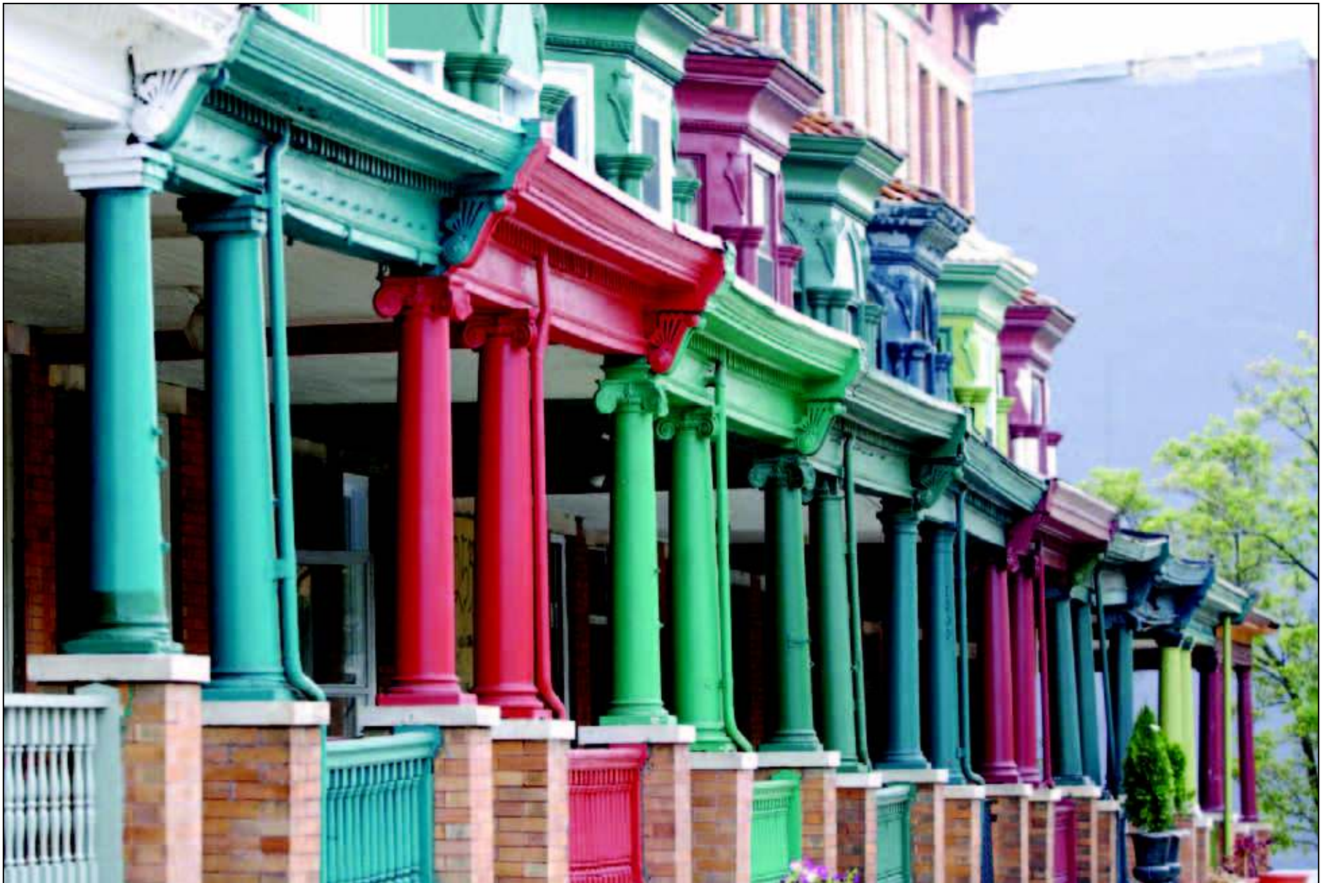
Colorful columns bring a sense of charm to Madison Avenue and Hendler Street near Druid Hill Park.