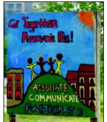
A sign promotes being neighborly.

"We're all different in the ways we were brought up, and we're different in our expectations of life," Pazornik said. "But I've found that we're not all that different."