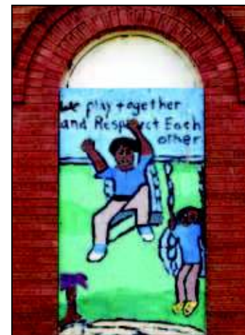
With the revitalization of Reservoir Hill well underway, some vacant homes, like this one the corner of Whitelock St. and Linden Ave., are decorated with boarded windows that promote friendship and respect.