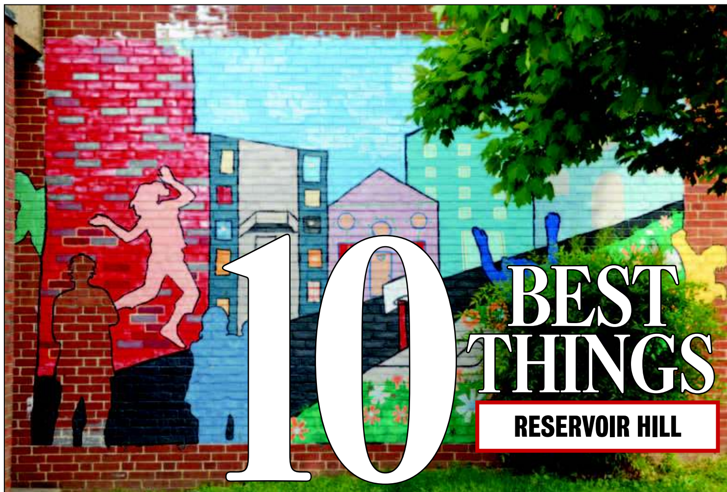
An active and fun community is depicted in a mural outside the John Edgar Howard Recreation Center at the corner of Lennox Street and Brookfield Avenue.