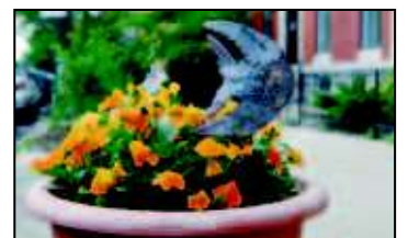
A pot of flowers accented by a decorative metal fish is among the many variations of decor you can find in the Reservoir Hill community.