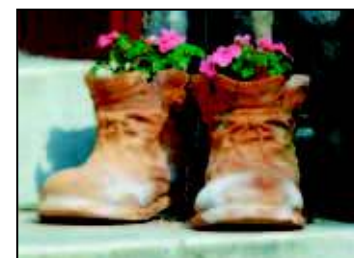
At first glance, what were thought to be actual work boots turned planter are actual clay boot flower pots on Lennox Street.