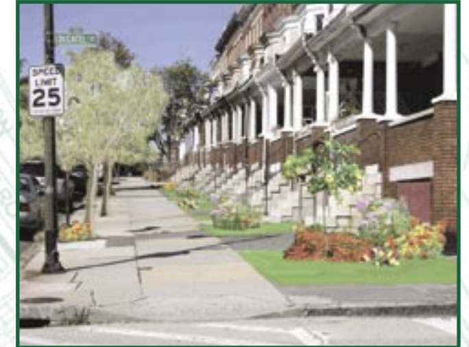
An image of how extra wide sidewalks can be used to create front gardens. Trees on the left side of the sidewalk have already been added thanks to the hard work of residents and RHIC staff.