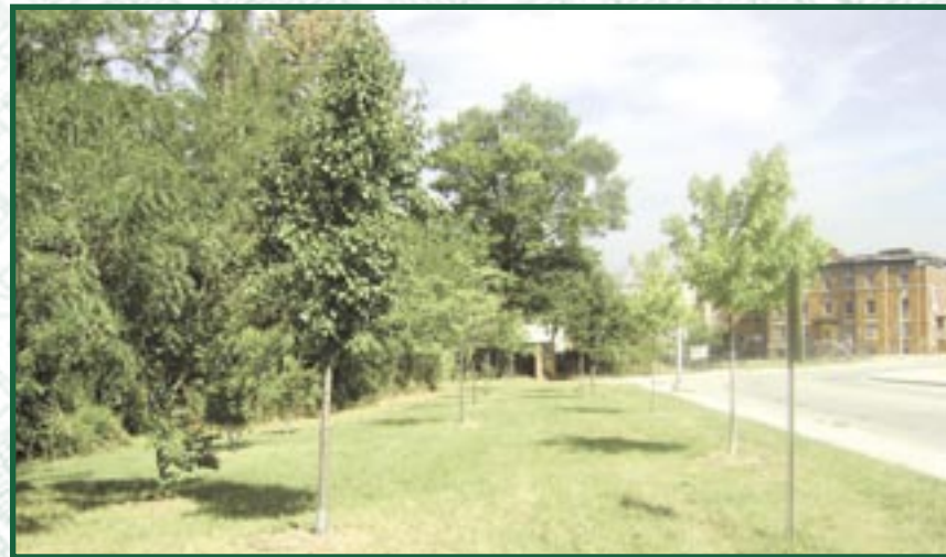
One Saturday morning in the fall of 2002, residents came from every direction with their gloves and shovels to remove debris, grade and till the land, and plant new trees and grass. Several years after its restoration, this lot on Whitelock Street continues to greet pedestrians and motorists with its beautiful trees and bed of grass.