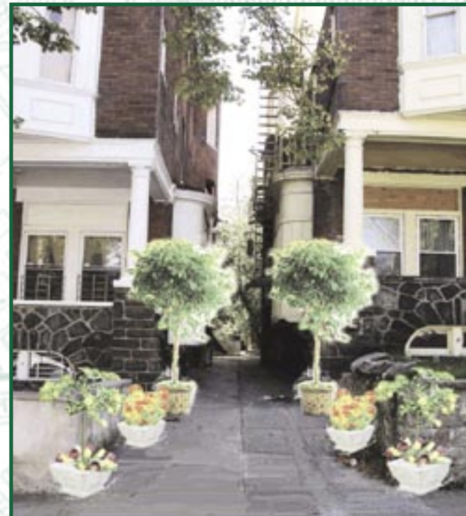
Potted plants are easy and fairly inexpensive to install and can significantly enhance an area such as this alleyway above by adding color and beauty. Plants that are well-maintained send the message that residents care for their community and are active participants in making it more beautiful.