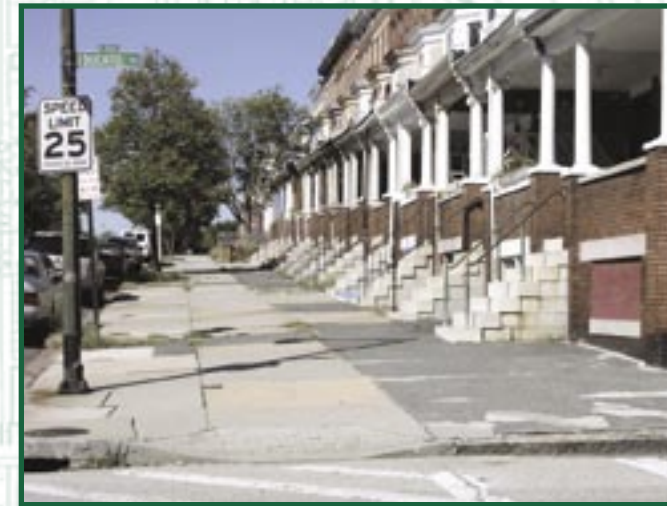
Extra Wide Sidewalks